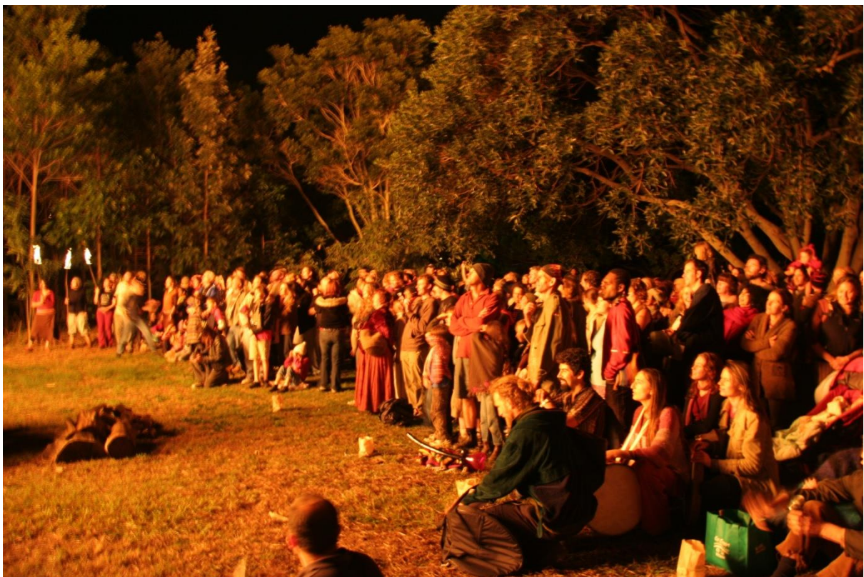
NSCF Winter Solstice Festival

We hope you enjoy your experience at the Farm and we thank you for your time, creativity and hard work.