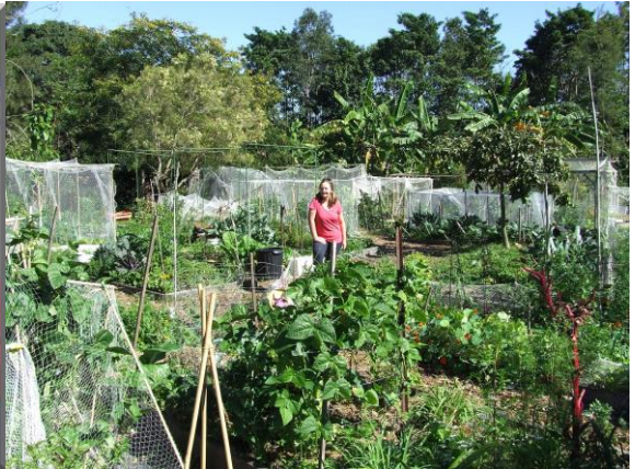
Volunteer activities at Northey Street City Farm